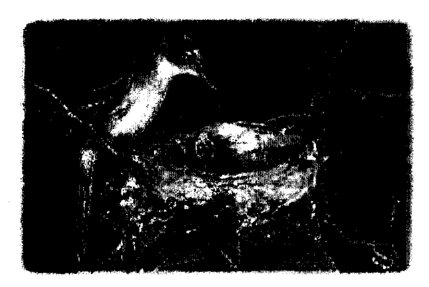
Figure B. Flycatcher<sup>6</sup>

of its length, but children age 2 to 14 are regularly observed bathing in the Creek during hot afternoons. On a peaceful Sunday afternoon, families of ducks can also be observed frolicking at many points on the creek. The bicycle path, shaded in places by riparian trees, along the creek is used extensively.