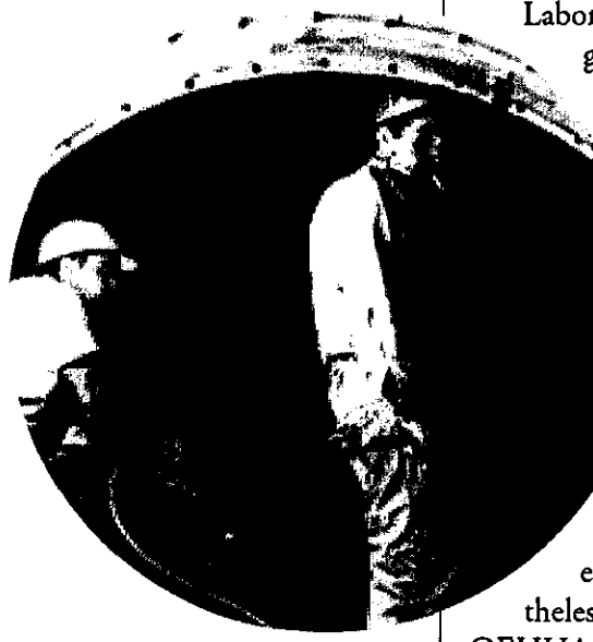
Family medical history, occupation, and personal habits, such as smoking, all influence an individual's risk of contracting cancer and other diseases.

Because the effects of the vast majority of chemicals have not been studied in humans, scientists must often rely on animal studies to evaluate a chemical's health effects. Animal studies have the advantage of being performed under controlled laboratory conditions that reduce much of the uncertainty related to human studies. If animal studies are used, scientists must determine whether a chemical's health effects in humans are likely to be similar to those in the animals tested. Although effects seen in animals can also occur in humans, there may be subtle or even significant differences in the ways humans and experimental animals react to a chemical. Comparison of human and animal metabolism may be useful in selecting the animal species that should be studied, but it is often not possible to determine which species is most like humans in its response to a chemical exposure. However, if