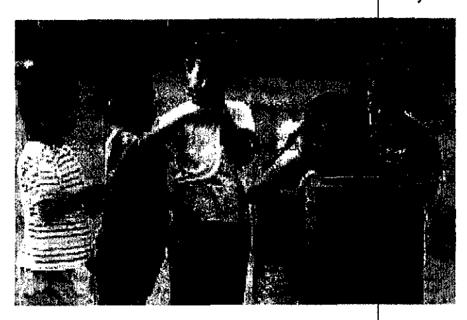
Health risk assessment helps regulatory agencies establish drinking water standards that protect human health while ensuring that water rates are affordable.

their customers could not afford. At the same time, the regulatory agency may determine that several treatment technologies could economically reduce the contaminant to the "one-in-100,000" risk level. By setting the drinking-water standard at the one-in-100,000 level, the regulatory agency could reduce health risks to acceptable levels while ensuring that water rates remain affordable.