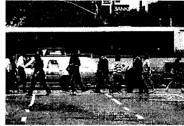
Health risk assessment estimates how current or future chemical exposures could affect a broad population.

The term "health risk assessment" is often misinterpreted. People sometimes think that a risk assessment will tell them whether a current health problem or symptom was caused by exposure to a chemical. This is not the case. Scientists who are searching for links between chemical exposures and health problems in a community may conduct an epidemiologic study. These studies typically include a survey of health problems in a community and a comparison of health problems in that community with those in other cities, communities, or the population as a whole.