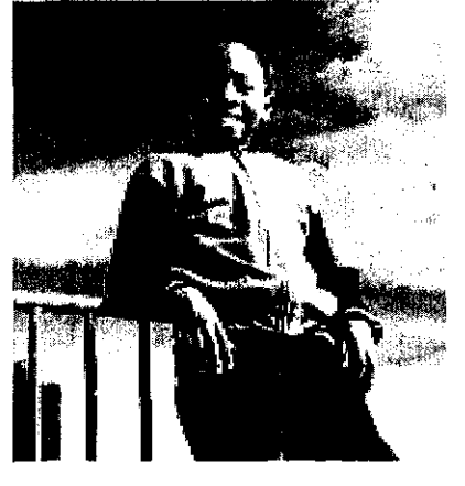
Health risk assessment takes into consideration children, the elderly, and other groups that may be particularly sensitive to a chemical.

Depending on the amount of uncertainty in the data, scientists may set a health reference level 100 to 10,000 times lower than the levels of exposure observed to have no adverse effects in animal studies. Exposures above the health reference level are not necessarily hazardous, but the risk of toxic effects increases as the dose increases. If an assessment determines that human exposure to a chemical exceeds the health reference level, further investigation is warranted.