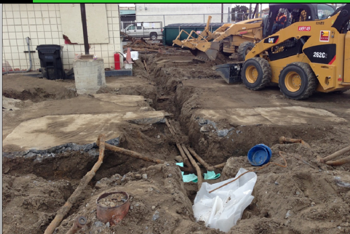
Photo: Removal of product piping at a former gas station

This Agency Status Report has been prepared as an in-kind task as a part of the Cooperative Agreement LS-97952501-5 between U.S. Environmental Protection Agency (USEPA) Region 9 and the California State Water Resources Control Board (State Water Board). It presents GeoTracker data for leaking Underground Storage Tank (LUST) closure rates, case age statistics, agency response times, and Low-Threat Underground Storage Tank Case Closure Policy (Policy) Validations for nine Regional Water Quality Control Boards (Regional Water Boards), and 21 Local Oversight Program Agencies (LOP Agencies), with open cases through the first half of California Fiscal Year 2013/2014 (CA FY 2013/2014), as well as a comparison to previous fiscal years (FYs).