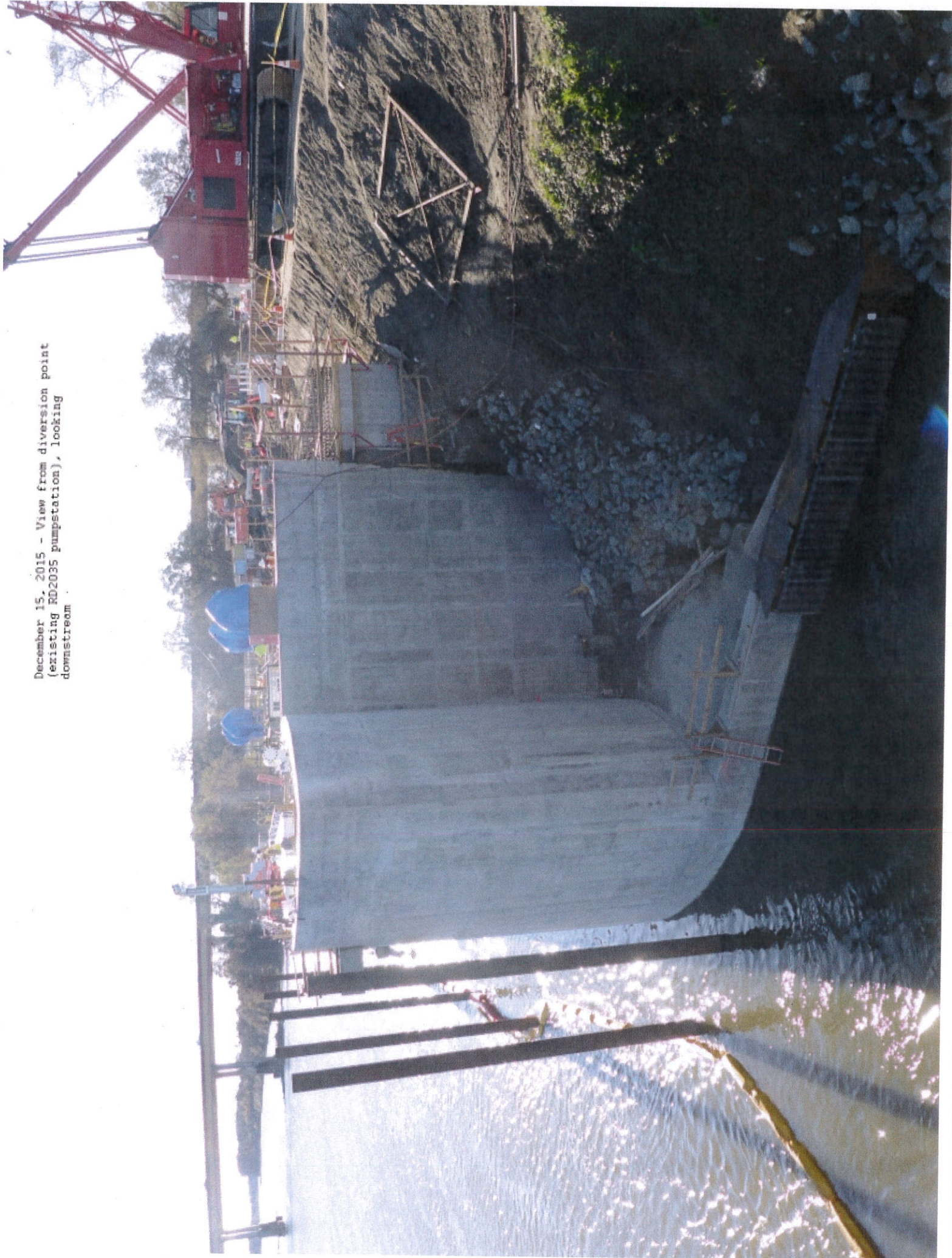
December 15, 2015 - View from diversion point (existing RD2035 pumpstation), looking downstream