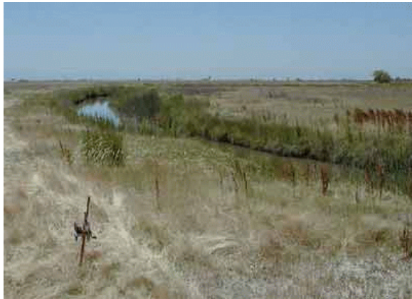
Expenditures for water delivery and improvements are a major part of public and private investments in the wetlands.

Compact growth makes more than economic sense: keeping more of the land surrounding the wetlands complex in some kind of agricultural use helps to preserve both the economic viability of agriculture in the County and its value in protecting the wetlands from the