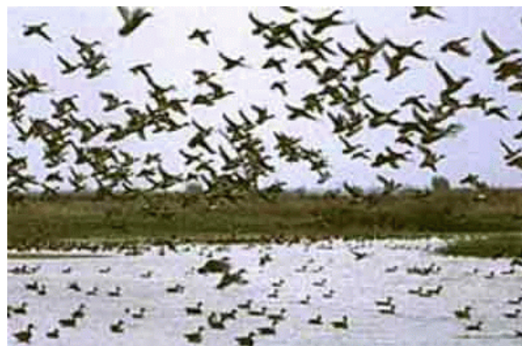
Waterfowl are central to private recreation in the Grasslands.

The typical total annual value of habitat maintenance and land acquisitions in the Grasslands is $16.4 million and the value of expenditures related to recreation in the Grasslands is about $11.4 million per year. With a multiplier of 1.41 to account for induced jobs and spending by other providing services to the wetlands users and managers, the total $27.7 million spent on the wetlands contributes $41 million per year to the local economy, and accounts for about 800 jobs. In Merced County as a whole, habitat management and wildlife-associated recreation contributes $53.4 million to the county's economy and accounts for about 1100 jobs.