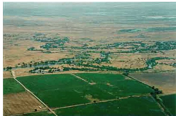
Agriculture is generally compatible as a buffer to the wetlands.

The total value of agricultural production in Merced County in 1998 was $1.45 billion