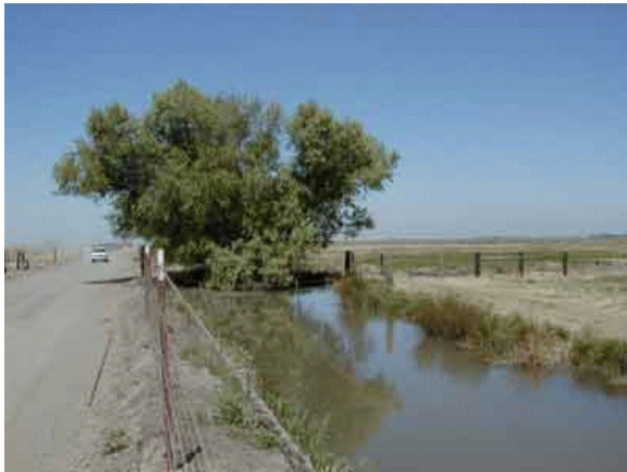
Water supply is a key part of the infrastructure needed to maintain habitat value in the wetlands.

agricultural values. Growth introduces more roads, motor vehicles, houses, noise, urban pets, pests, vandalism, litter and the like into the pristine wetland environment. California Department of Finance projections show a growth in the total Merced County population from 198,000 to about 620,000 people by the year 2040. The number of urban acres is expected to increase from about 50,000 to as many as 94,000 to accommodate this population growth as well as the associated commercial and industrial development within the cities. The Merced Case Study looked at two growth scenarios: conventional or “sprawl” growth at a density of 5.5 persons per acre (2.2 dwelling units (DU) per gross acre) 1 and a more compact scenario of 10.7 persons per gross acre (4.3 DU per gross acre) and 10% of the residential and job growth as infill rather than annexation of lands around cities.