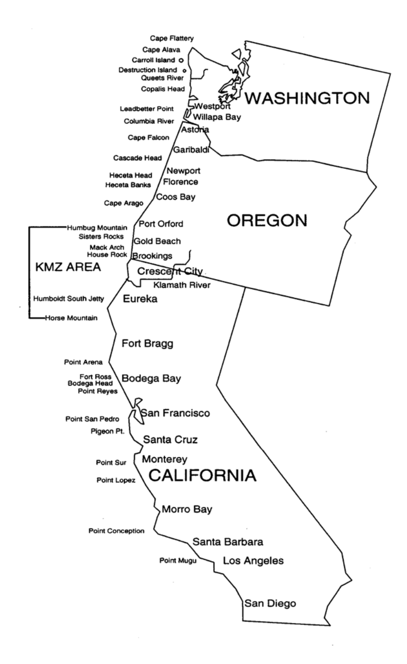
FIGURE 6-1. Management boundaries in common use during the early to mid- 1990's.