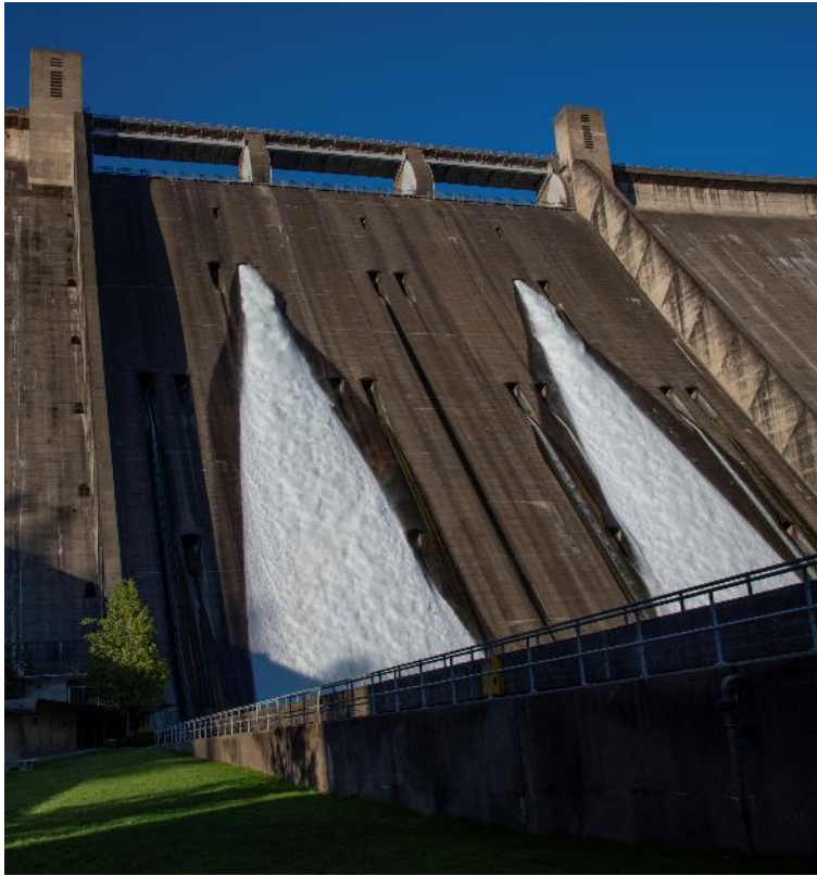
Water temperature testing on April 10, 2021 for use of the river outlets on Shasta Dam, near Redding, CA - Reclamation/Amy Holland.