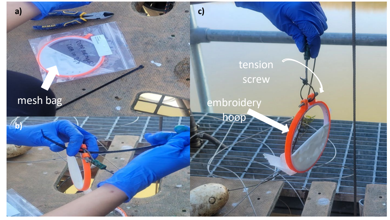
Figure 2. a) outgoing SPATT, b) attach outgoing SPATT to steel cable, c) outgoing SPATT ready for deployment.

SPATT samplers will be stored in the DISE EMP -20°C freezer until retrieved by USGS. Note the SPATT retrieval date and time on the SPATT log adjacent to the EMP freezer.