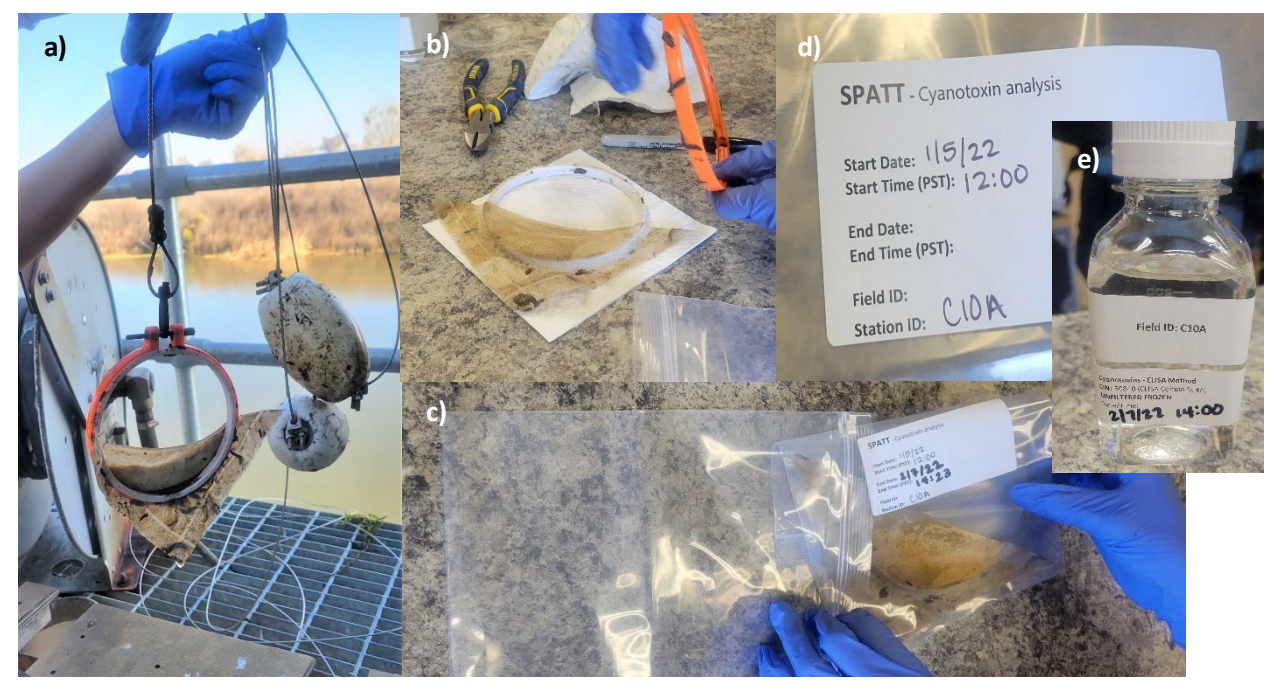
Figure 2. a) SPATT retrieval, b) SPATT bag removed from embroidery hoop, c) SPATT sampler double bagging, d) SPATT label, e) cyanotoxin water sample label.