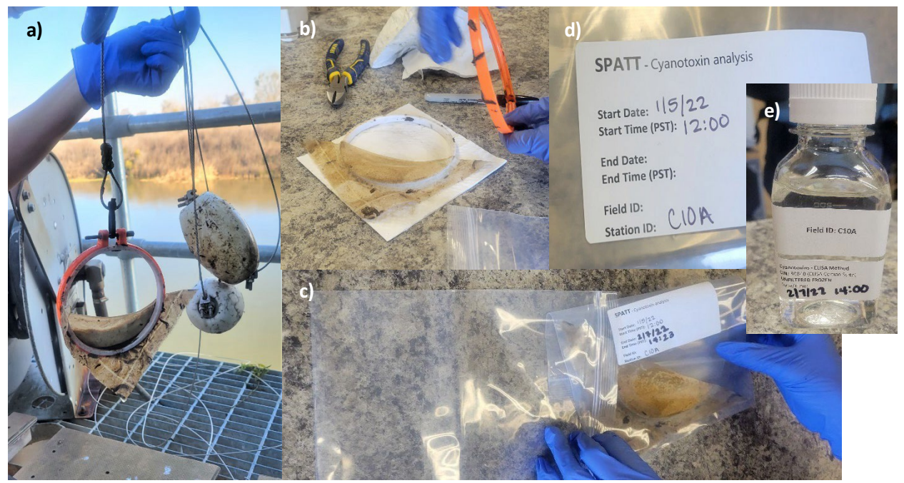
Figure. 2. a) SPATT retrieval, b) SPATT bag removed from embroidery hoop, c) SPATT sampler double bagging, d) SPATT label, e) cyanotoxin water sample label.