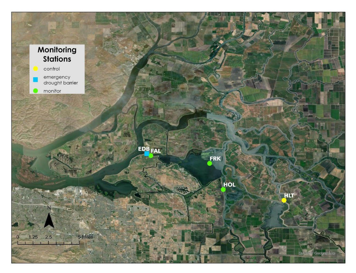
Figure 1. Station map of monitoring and control stations and the Emergency Drought Barrier.