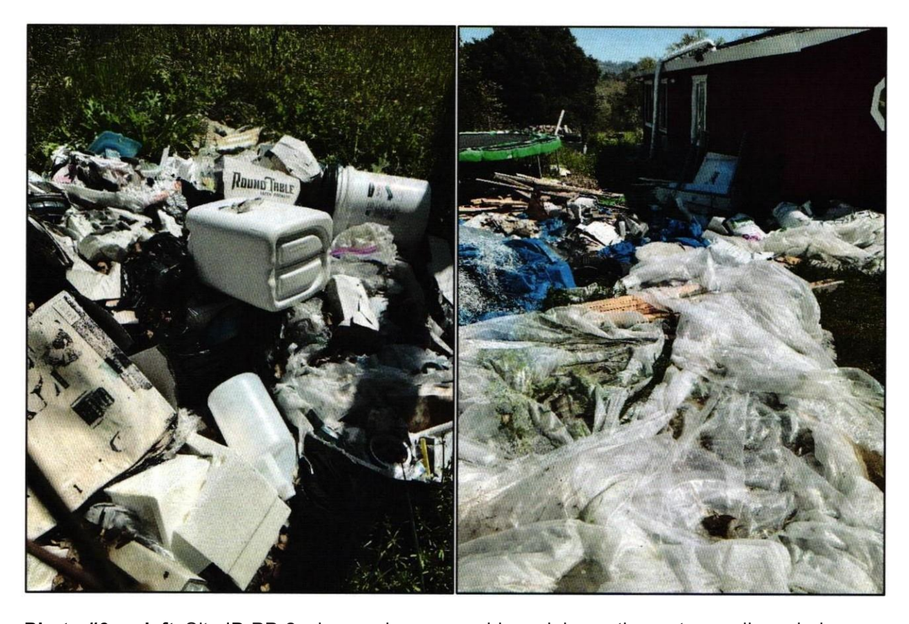
Photo #6 on left , Site ID PP-2: shows where cannabis and domestic waste are discarded on the ground near a stream. Photo #7 on right , Site ID PP-3: shows where cannabis waste is deposited on the ground near a stream.