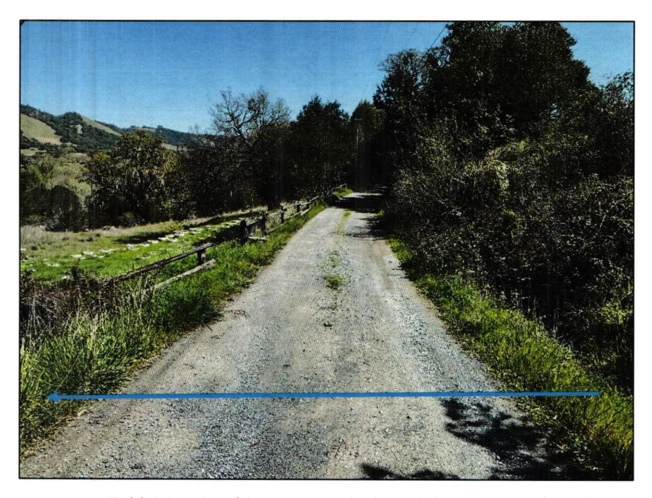
Photo #3 site ID SC-1: Location of the stream crossing beneath the access road. A misaligned culvert conveys flows into the field, visible at the left side of the photo. The approximate culvert location is represented by the blue arrow.