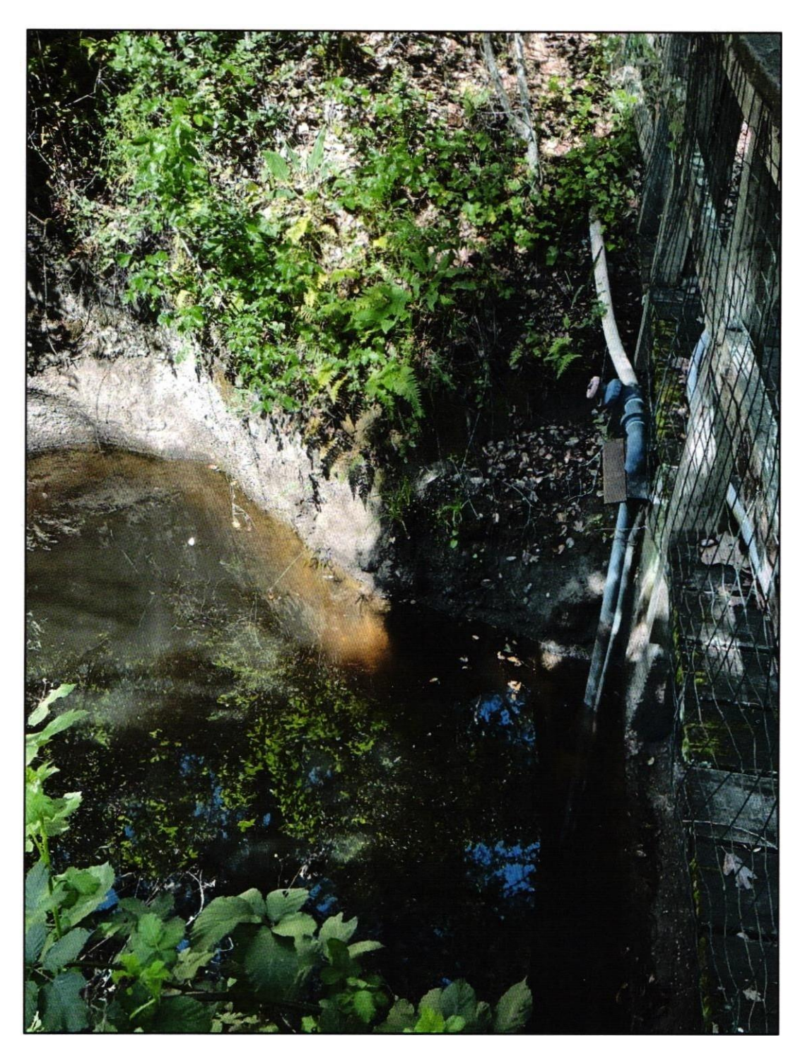
Photo #4 , site ID WS-1: The location of a diversion pipe submerged in the reservoir for apparent cannabis irrigation. The pipe was traced back to a cultivation site.