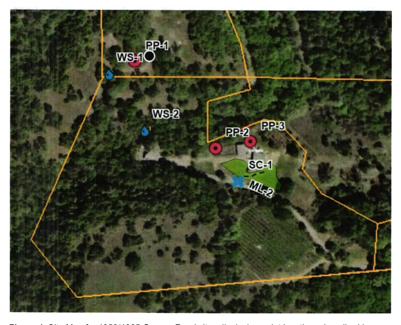
Figure 1: Site Map for 4050/4065 Grange Road sites displaying point locations described in Table 1.