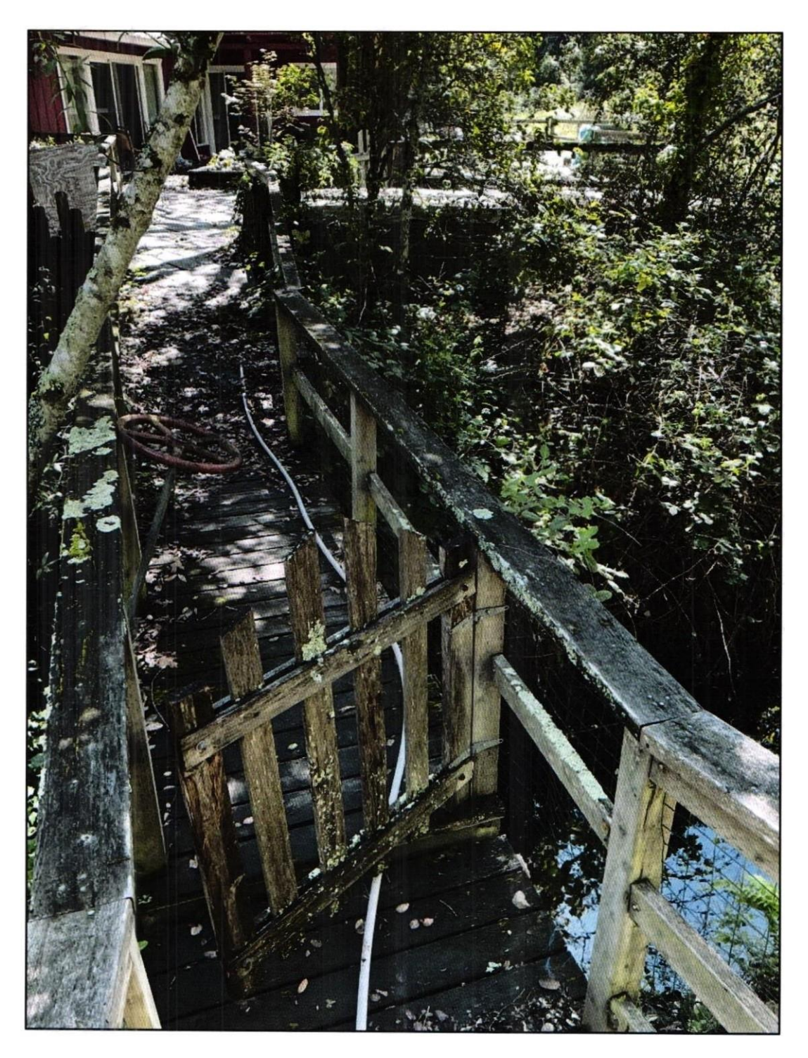
Photo #5 , site ID HAL-1: The location of channel spanning dam. This photo shows a footbridge over the top of the concrete dam. Impounded water is visible on the right side of the photo.