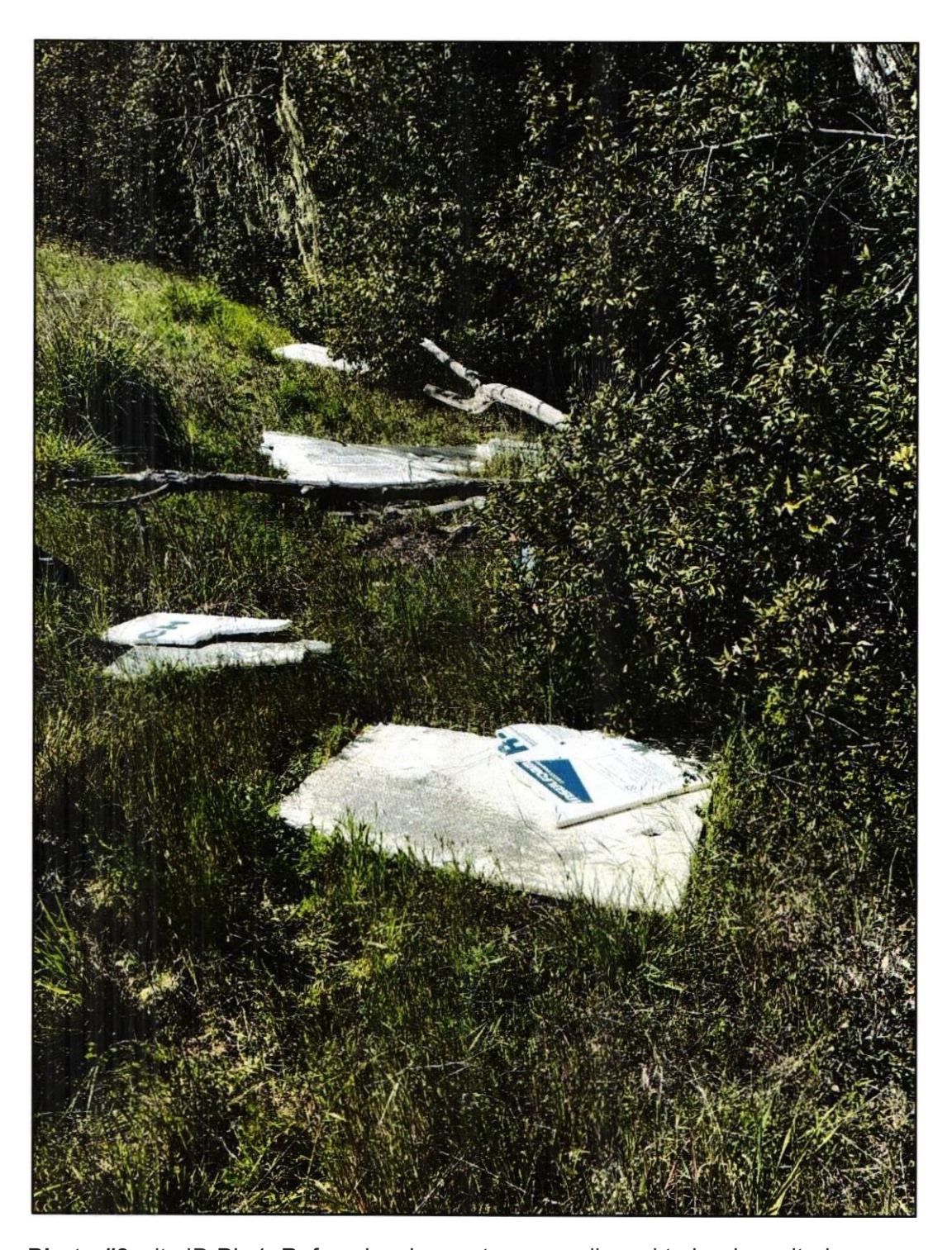
Photo #8 , site ID PL-1: Refuse has been strewn or allowed to be deposited along the edge of a stream channel.