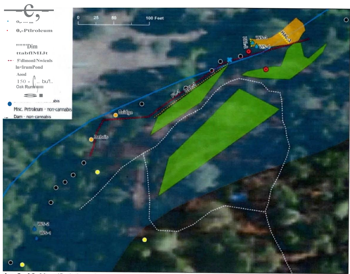
Map 2 of 2. Magnified view of area near Oak Run Creek for APN 098-160-016-000 SHA.