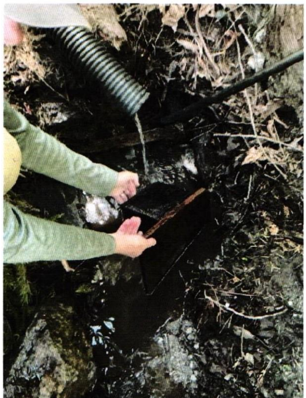
Figure 1. 1602(a) violation includes substantial diversion of the natural flow of an unnamed tributary to Lamb Creek. The screen box was the intake for POD 1 while the corrugated plastic pipe collected flow and directed it to the intake. The black poly pipe was supplemental water diverted from POD 2.