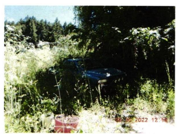
Figure 4. 5652(a) violations include domestic/ cannabis related waste and abandoned vehicle within 150 ft. of the high-water mark of waters of an unnamed tributary to Lamb Creek.

Additionally, while CDFW staff were conducting their inspection it was documented that the waterline from POD 2 split at the location marked as POD 3 on the enclosed map. This supply line led towards the same stream that POD 1 diverted from, and it is highly likely that this was an additional surface water diversion. However, at this point, staff determined that logistics no longer made following this additional water line feasible.