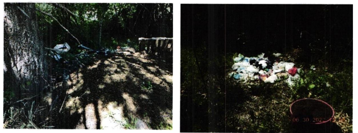
Figure 3. 5652(a) violations include domestic and cannabis related waste within 150 ft. of the high-water mark of waters of an unnamed tributary to Lamb Creek.