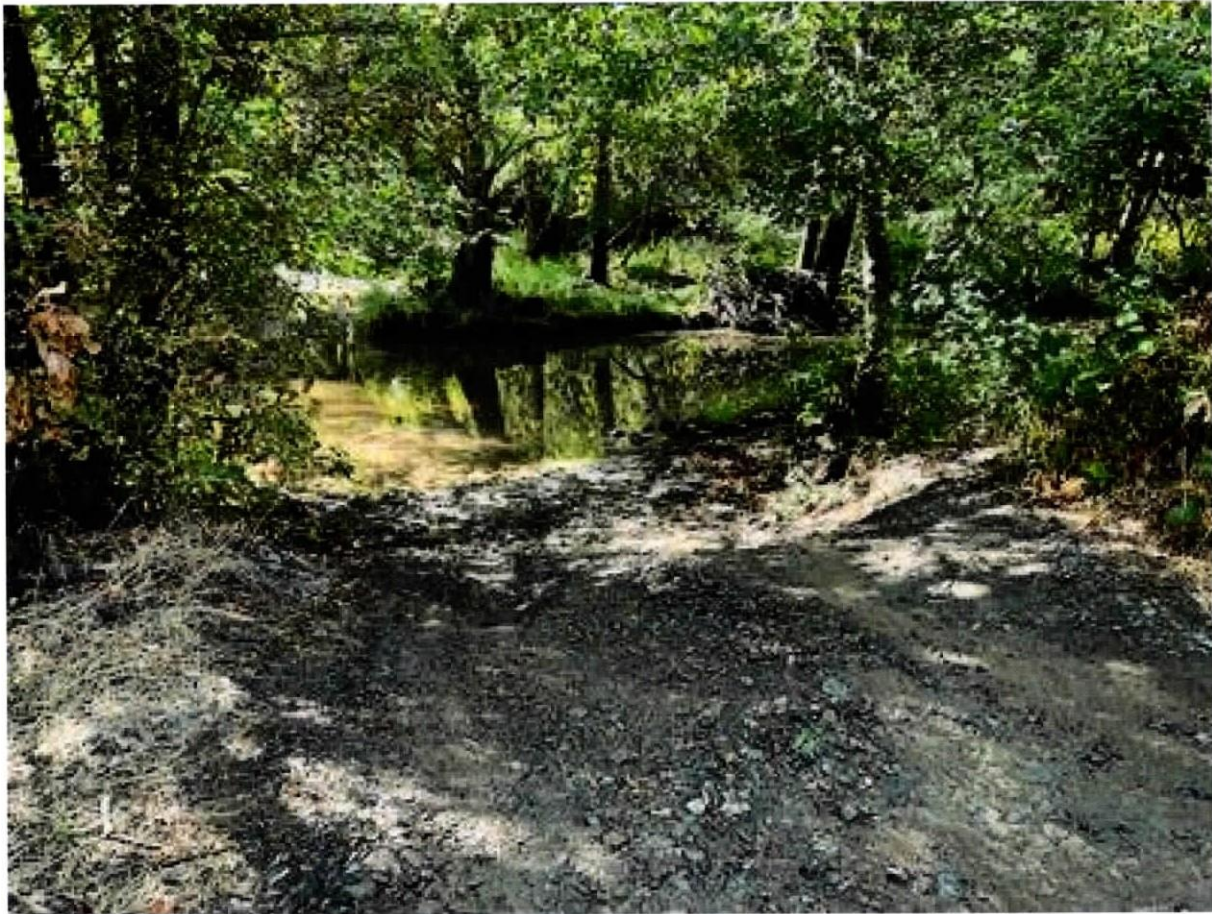
SC-1: Wet ford crossing of Outlet Creek, showing east approach. Fine sediment on the roadway (from both approaches) may pass into the creek, which is a violation of FGC Section 5650.