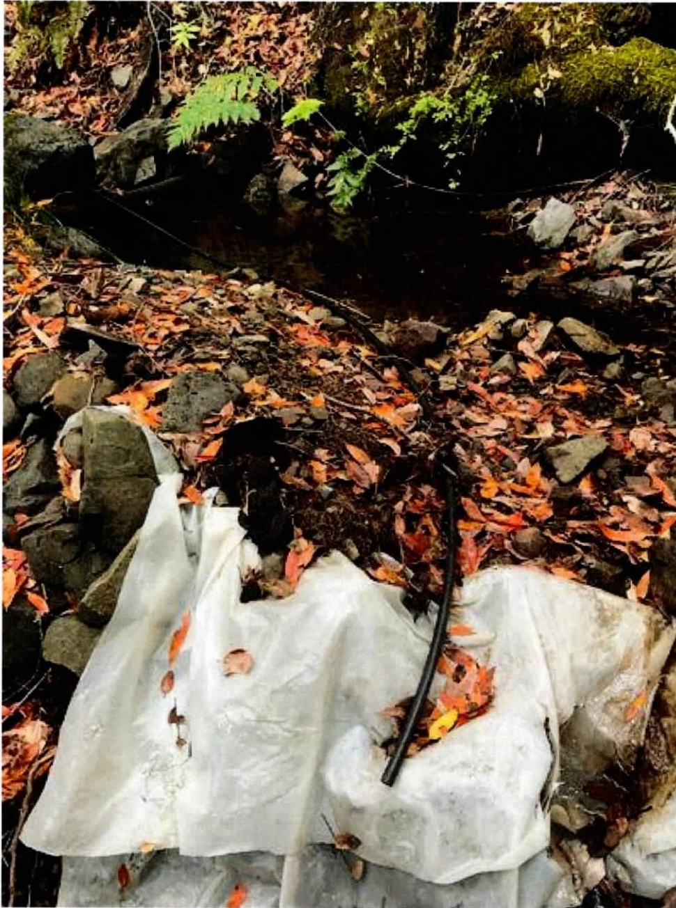
WS- 1: Plastic garbage left within the stream channel, a violation of FGC Section 5652.