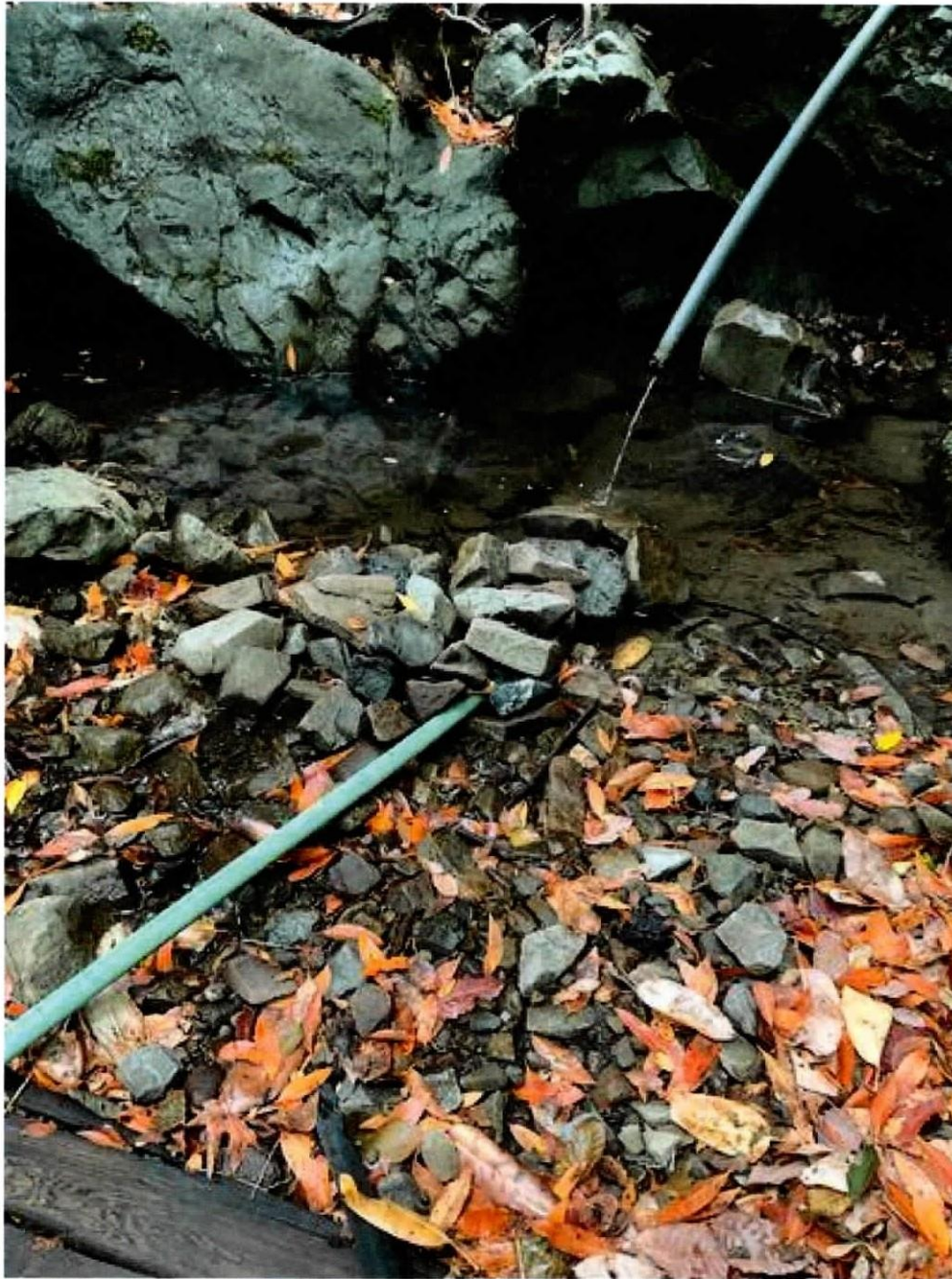
WS-1: Unpermitted water diversion intake. This FGC Section 1602 violation had an unscreened pipe opening held approximately six inches below the water surface by piled rocks. Pipe remnant above.