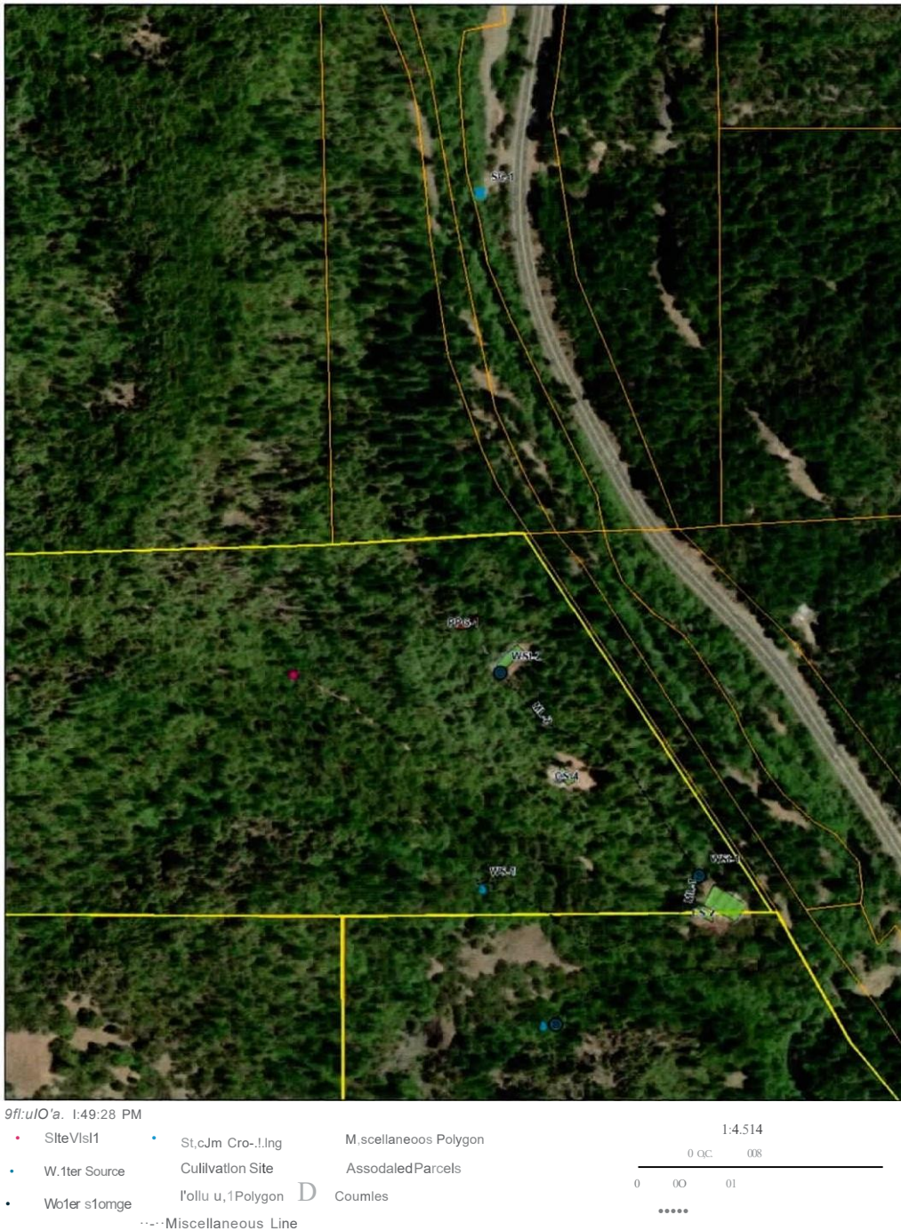
Map 1: Activities documented during site visit on 9/19/2022. FGC violations were documented at SC-1 and WS-1.