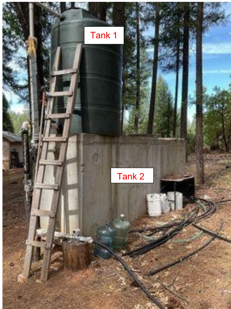
Photo 1 (POS1): Tanks 1-2. Tank 2 is the concrete rectangular box.