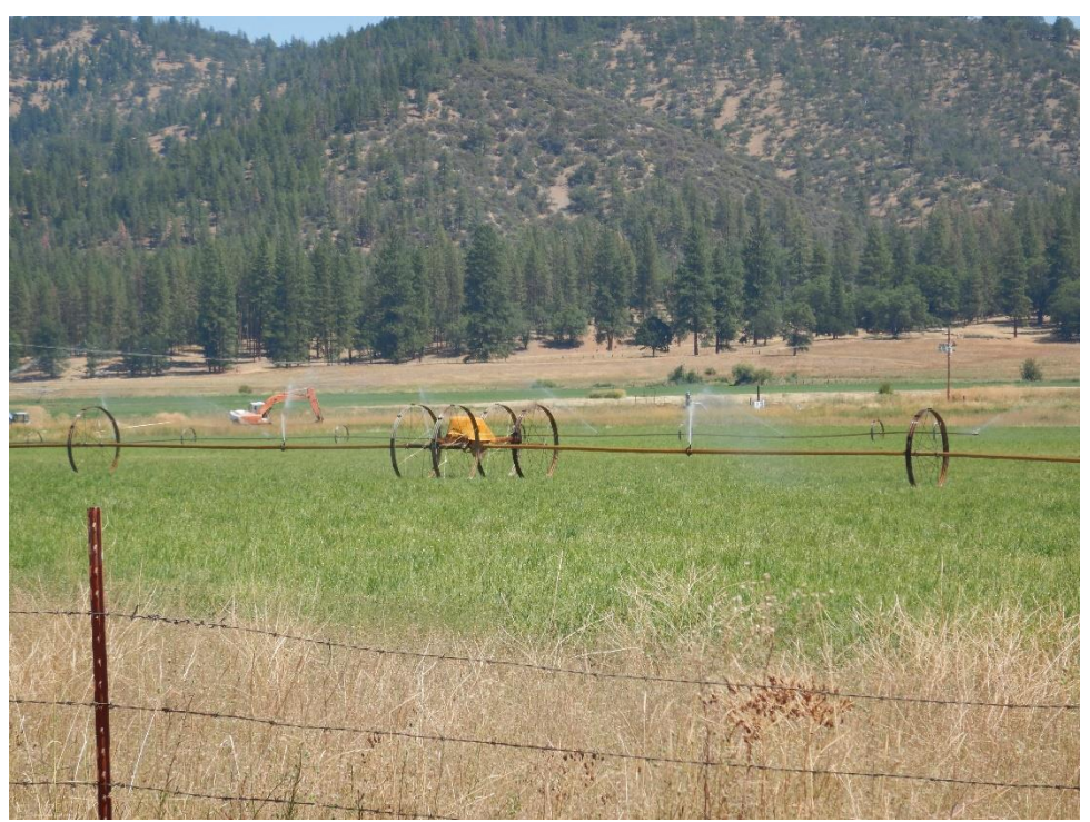
August 19 photograph showing irrigation at the Place of Use