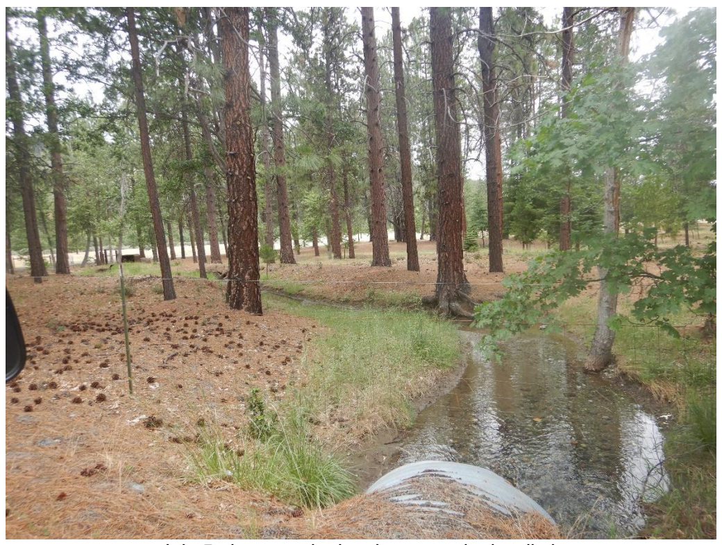
July 5 photograph showing water in the ditch