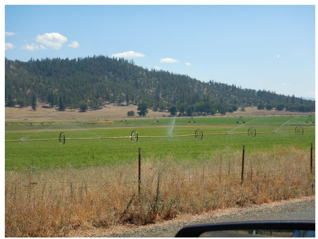
August 19 photograph showing irrigation at the Place of Use