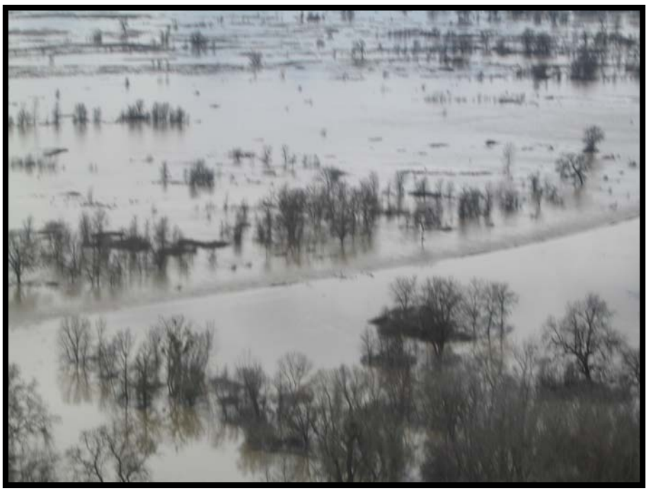
Fremont Weir Looking West on February 20, 2004