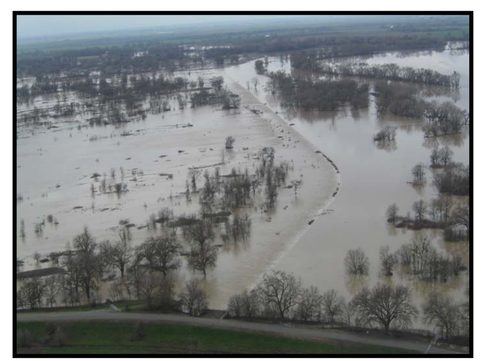
Fremont Weir and Sacramento River Looking North on February 20, 2004