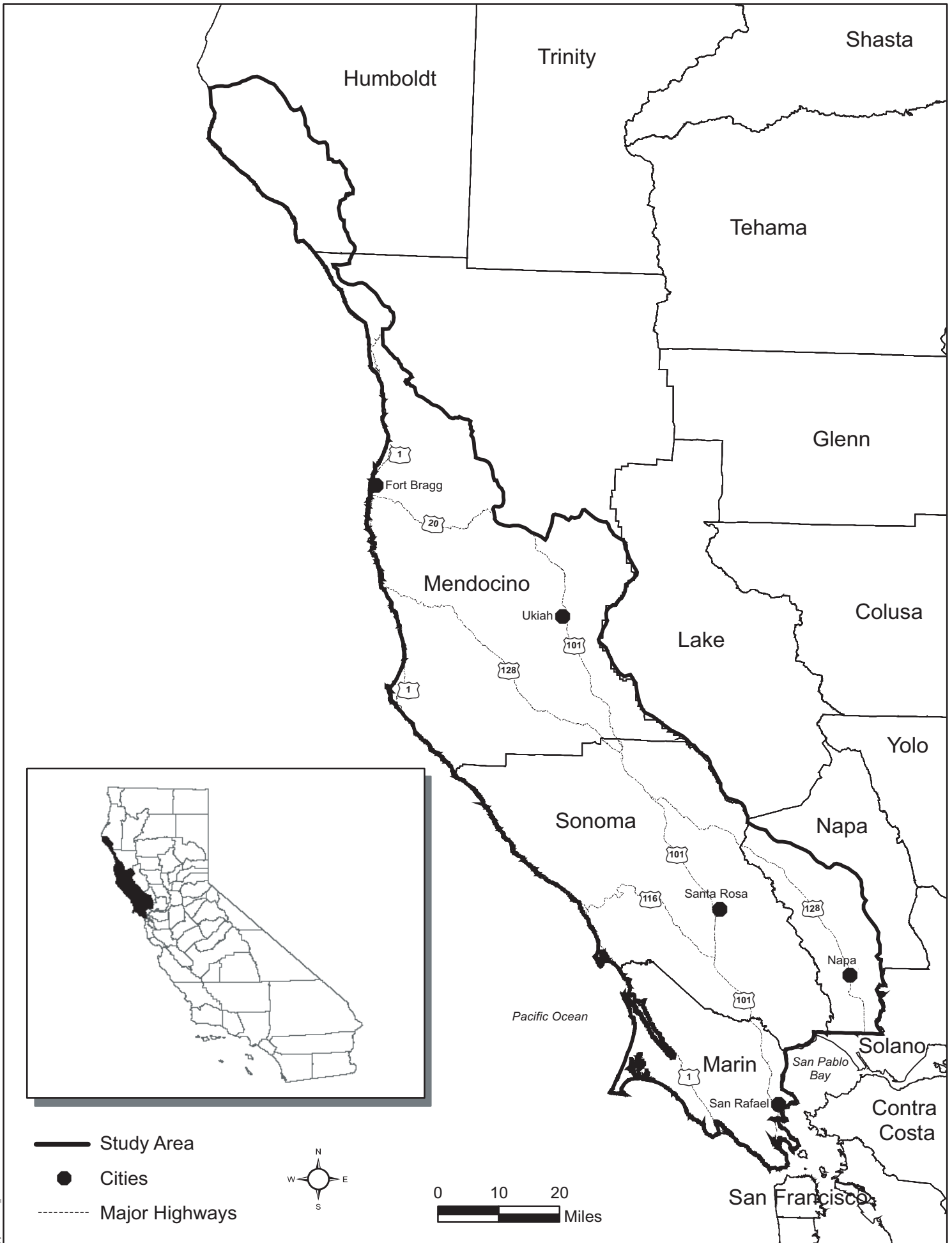
Figure 1 Project Location/Policy Area