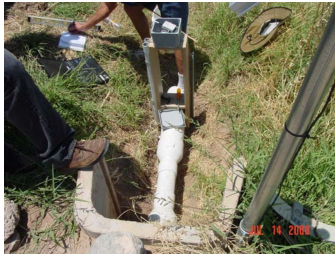
Figure 7. Runoff measurement venturi at Palo Verde

Figure 7 and Figure 8 show the pipe-fitting Venturi and solar powered datalogging system being installed to measure and record field runoff. A small solar charging system was set up to power a differential pressure transducer linked to a datalogger at the site.