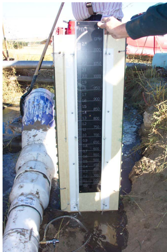
Figure 4. PID demonstration pipe-fitting Venturi and manometer

A specialized manometer board was fabricated for the PID demonstration site that featured a sliding scale. The scale was marked to show head differential in feet and also to show flow rate in gallons-per-minute (the flow rate measurement units historically utilized by PID). To determine flow rate or head differential, the sliding scale would be raised until the zero line on the scale was even with the height of water in the low pressure manometer tube linked to the throat tap. Flow rate and head differential could then be read as the values from the respective scales that lined up with the water level manometer linked to the higher pressure upstream section tap. A manometer tube attached to the downstream tap was installed on the manometer board adjacent to the upstream manometer tube. Comparison of water levels in the upstream and downstream tubes provided visual evidence of head loss experienced by flow passing through the Venturi meter. Figure 4 shows the manometer board at the PID demonstration site.