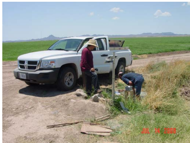
Figure 8. Installation of logging system at Palo Verde runoff venturi