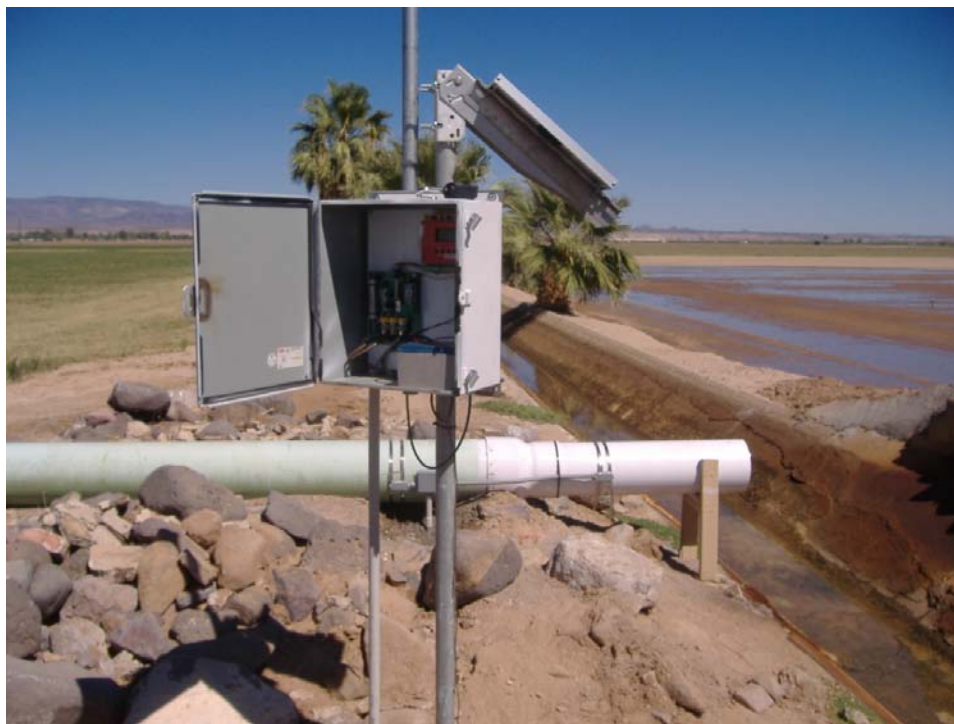
Figure 6. MVIDD pipe fitting venturi meter demonstration site

In 2008, the Water Conservation Field Services Program of Reclamation's Yuma Area Office (YAO) requested technical assistance from HILS to identify cost-effective flow measurement methods that could function reliably over time given the water quality issues present along with other site-specific constraints at MVIDD. An automated data collection system was also a desired capability for the flow measurement system capability. YAO and MVIDD agreed to set up a demonstration site configured with a pipe fitting Venturi as a preliminary step in design of a flow measurement system. Figure 6 shows the MVIDD demonstration site.