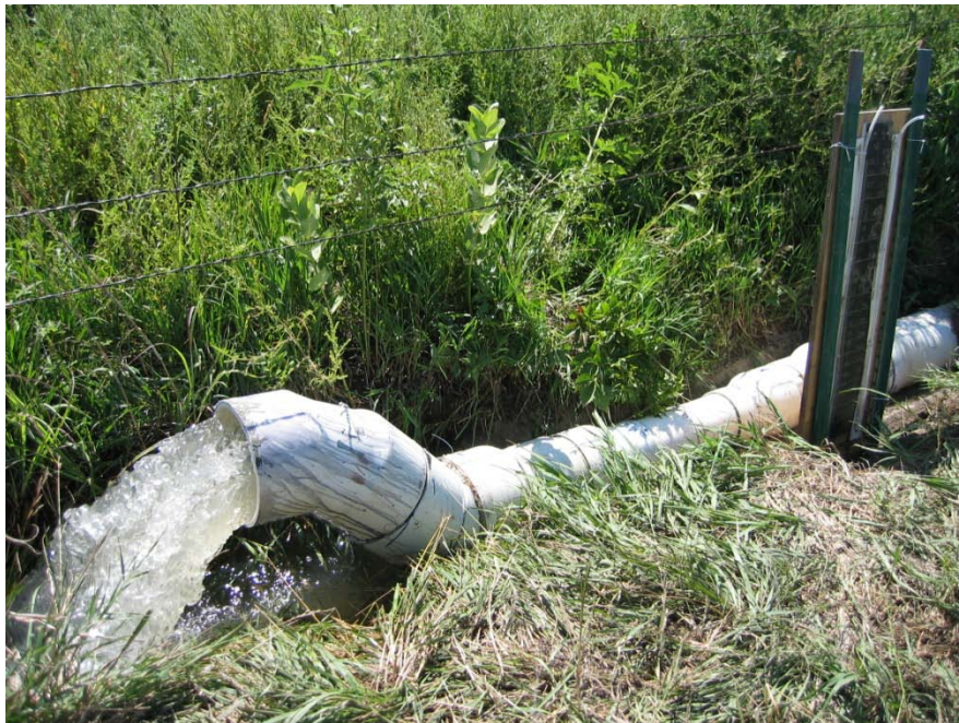
Figure 5. PVC Venturi meter and manometer installed at the second PID site

At the request of PID staff, the PVC Venturi meter was later re-installed in 2004 at a different turnout. The new location was higher in the PID delivery system within the Colorado delivery area. Figure 5 shows re-installed Venturi.